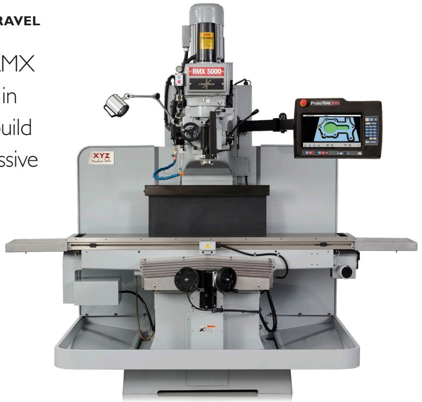
Guards removed for clarity

Advanced Features. Riser Blocks. Offline Software. Tooling, Vices etc. DXF Converter. Parasolid Converter. Programmable 4th Axis.