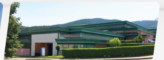
Machining plant 970 m2 | Elorrio – Spain