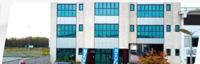
COMMERCIAL OFFICE | TECHNICAL ASSISTANCE SERVICE | SHOWROOM Milan – Italy