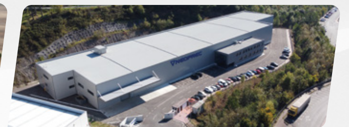
New machining plant 10,000 m2 | Mallabia – Spain