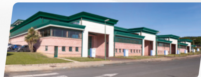
Machining plant 4,900 m2 | Elorrio – Spain