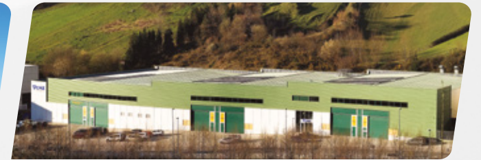
CNC lathes Assembly plant 10,000 m2 | Mallabia – Spain