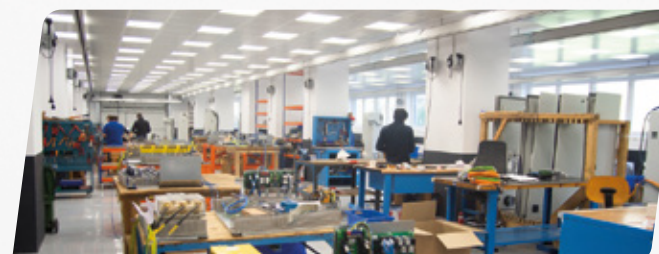
Assembly plant for electrical cabinets 1,250 m2 | Zaldibar – Spain