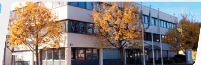
COMMERCIAL OFFICE | TECHNICAL ASSISTANCE SERVICE Stuttgart – Germany