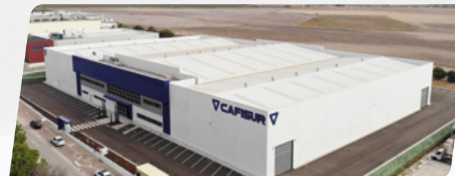
Sheet metal plant 15,000 m2 | Cádiz – Spain